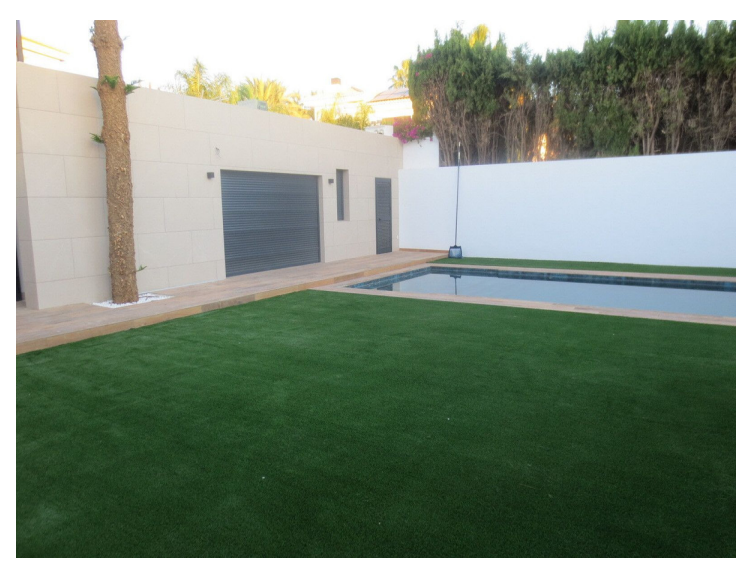
CALLE LAS PALOMAS DEL COTO MIJAS